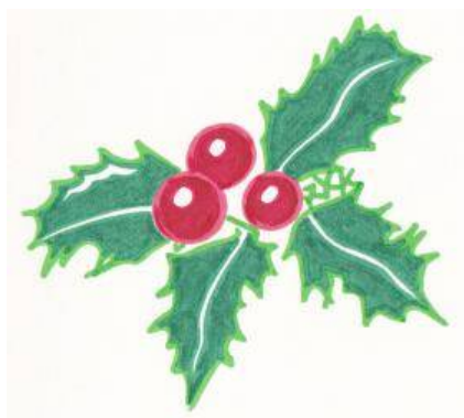
Drawing Ruth King

Network Magazine is looking for articles on growing vegetables, flowers or other general garden related advice. Please send to beckington.network@gmail.com Thank you.